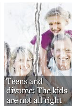
Teens and divorce: The kids are not all right