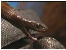
Most toxic snake bites teen