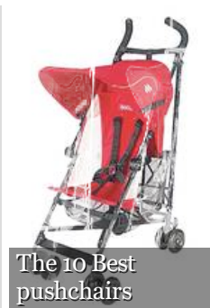
The 10 Best pushchairs