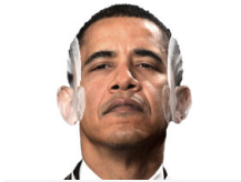
Controversial Video Spreads Virally After