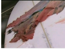
Surfer attacked by shark